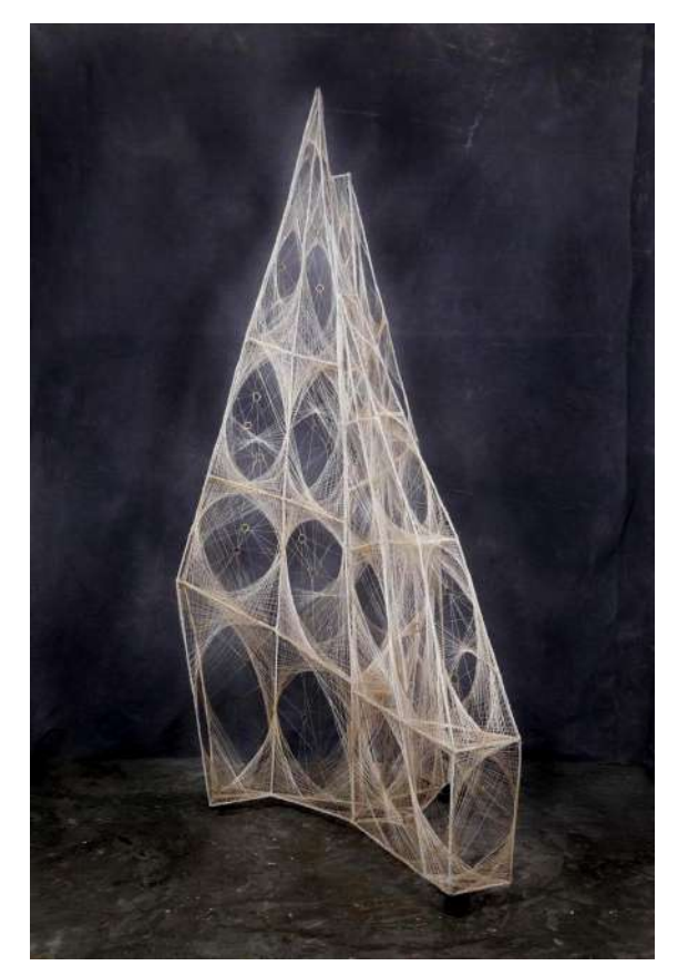
Remembranza Series Technique: Thread, metal structure Measurements: 1.85 m x 0.96 m x 0.82 m